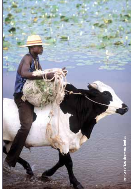
Institute of Development Studies

Assessing how young people interact with the agri-food sector in different countries and contexts, and how policies and programmes can respond to their needs and aspirations